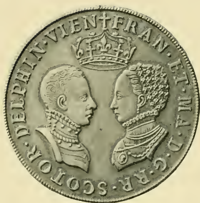
BRIDAL MEDAL OF MARY STUART AND THE DAUPHIN, 1558